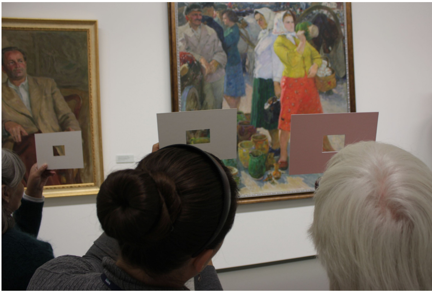
'Guided tour in the National Gallery of Art in Vilnius'